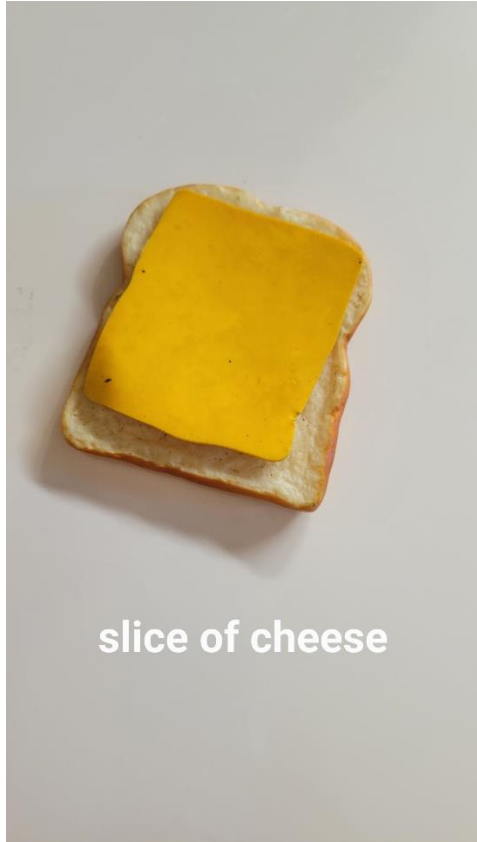
slice of cheese