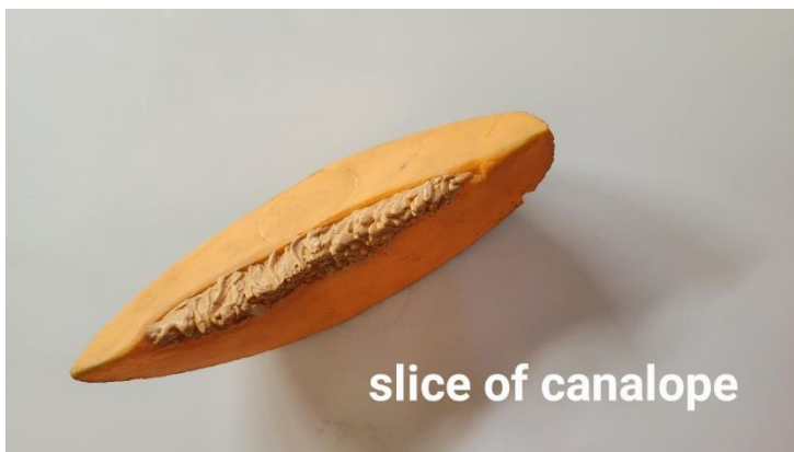
slice of canalope