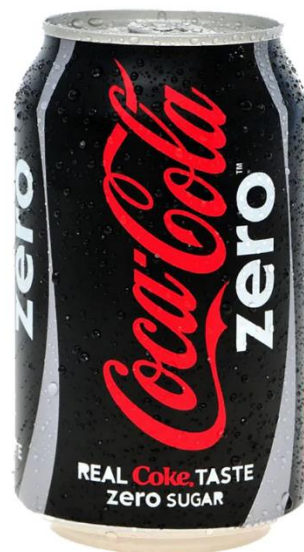
REAL Coke TASTE ZERO SUGAR